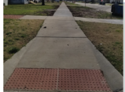
Top: Looking east from the intersection of 10th and Read to the south side of 10th street.